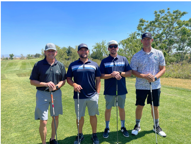
2022 Golf tournament participants at Morongo Tukwet on May 6 2022